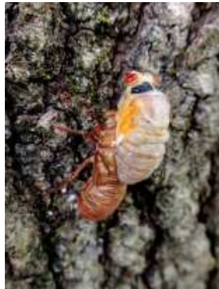
Adult periodical cicada emerging from its exoskeleton.

There are so many that you can hear them all as they crawl through the grass up and up into the trees—one enormous rustle. Pure white when they shed their exoskeletons, they darken as their new exoskeletons harden and their wings expand by filling their wing veins with insect blood called haemolymph. The males emerge first, and when the females emerge, the males begin to sing to get their attention. And they like to sing LOUDLY (like Lutherans!), often so loudly that you cannot hear yourself speaking when you are outside. It is like standing next to a loudspeaker playing the sounds of European ambulances. The spectacle of billions of insects flying and calling is a sight to behold, unlike anything that we normally experience. It's one of the more amazing phenomena in God's creation.