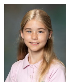
Greer Flagstad: "The Bird Woman" / "Park Stroller"