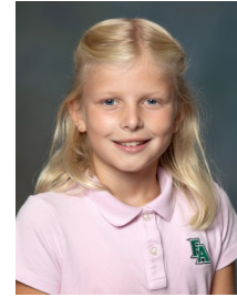
Southern Evans: "Tyro," A Statue "Honeybee" "Park Stroller"