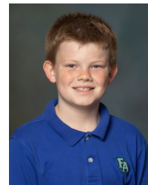
William Temple: "The Policeman" / "Chimney Sweep"