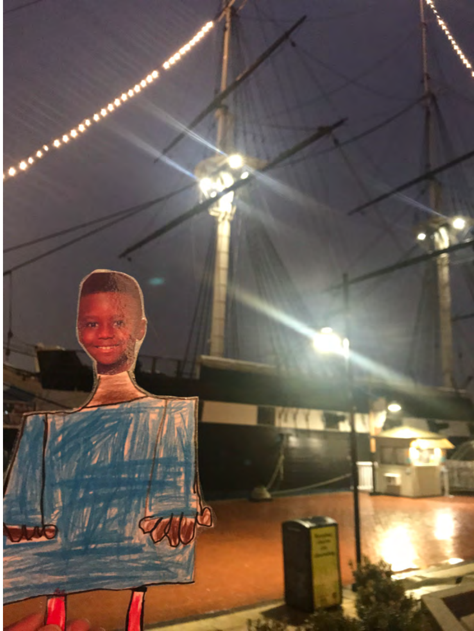
Walking the boardwalk Baltimore Inner Harbor