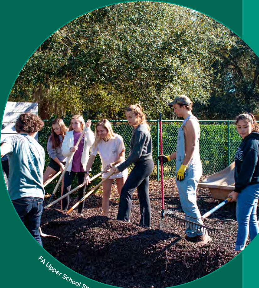
FA Upper School Students, 2020 Hands on Frederica

The foundation of a vibrant and supportive school community relies on the concept of time, talent, and treasure. Much of this Appreciation Report focuses on the treasure aspect. However, the time and talent pieces are just as valuable and contribute mightily to the morale and emotional well-being of a school community, especially at Frederica Academy.