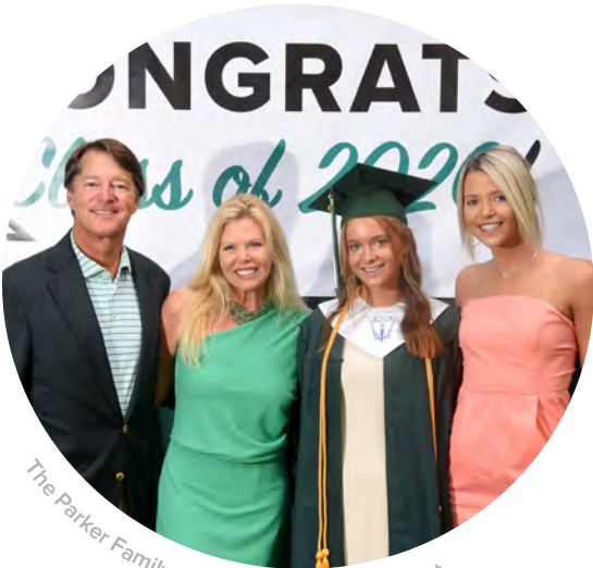
The Parker Family, 2020 Baccalaureate Event