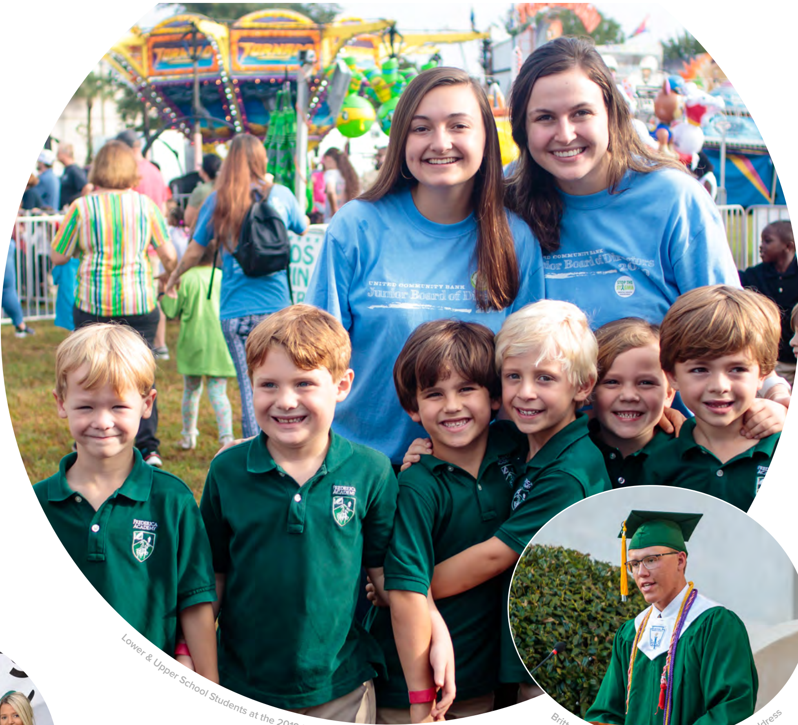
Lower & Upper School Students at the 2019 Brunswick Fair