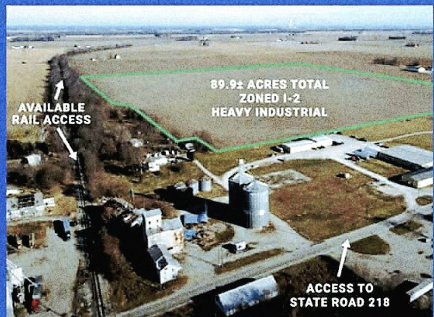
JNT Farms rail-served plot.

Located in Camden, IN, this 89.9-acre property has rail access on its west side, with Genesee & Wyoming Railroad Services Inc providing potential siding options. It's part of the Duke Energy Site Readiness Program and offers various incentives for potential buyers.