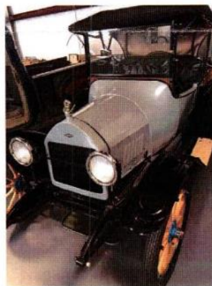
One of 14 still in existence!

Saturday's complete schedule is printed on the back.