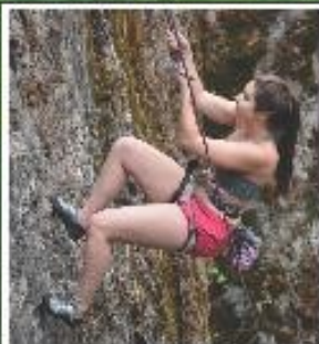
LIONS Diabetic Camp

See link to watch video: https://www.campmccumber.com