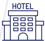
Little Shell Hotel