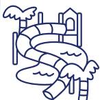
Little Shell Waterpark