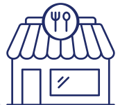
Restaurants & Beverage Venues