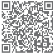
Scan to schedule an appointment.