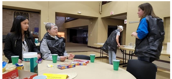
Brave High School students performing different activities during 'Fear Factor' at Sunday night's youth event on Sunday, March 27.