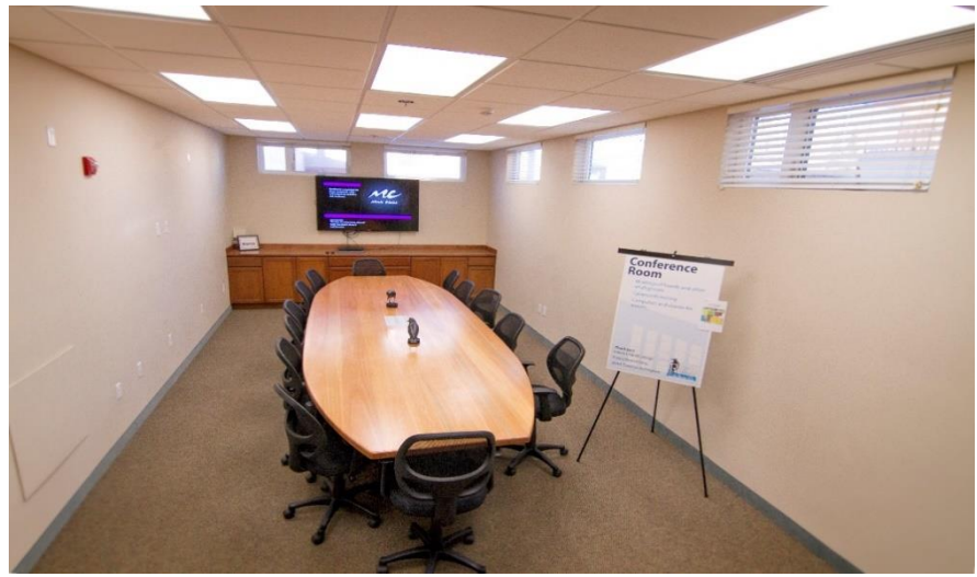
*Both of these rooms have portable sound systems available for use.

Our Conference Room can be utilized for meetings of any kind. The room boasts a beautiful custom conference table with table top connectors and a 70 inch HD television with web conferencing capabilities.