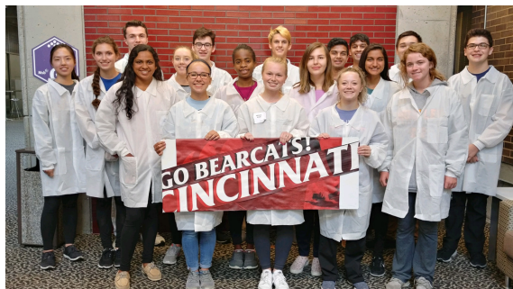
PICTURED: STUDENTS FROM 2019 PROGRAM