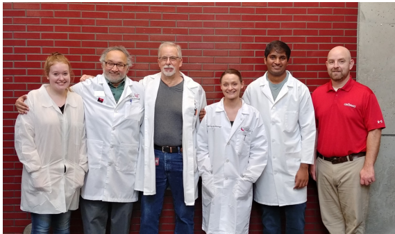
PICTURED: STAFF FROM 2019 PROGRAM