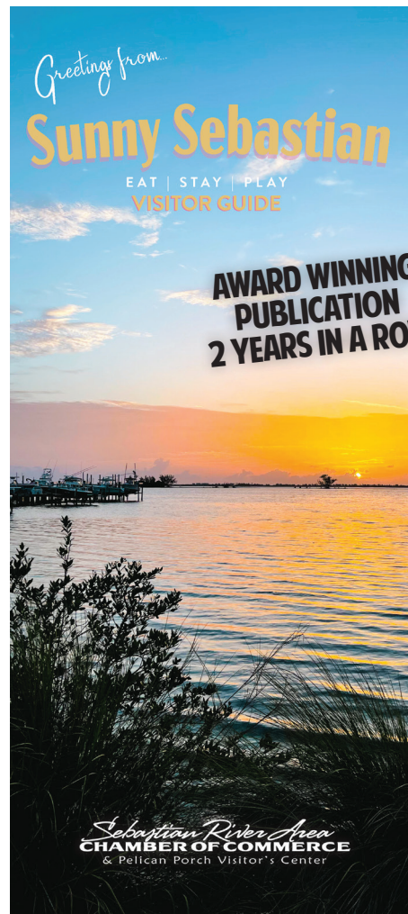
Previous Edition 2022/23