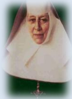
St Katharine Drexel

Prepare a bulletin board with the names and Images of saints whose feasts are celebrated during the month of March. Pictured to the left are some of the more notable Saints familiar to many of our students, Share with the students the stories of these Saints, emphasizing the sacrifices that these Saints made to work at building the faith. Tell the students that. Although some of these saints never put foot on American soil, they had a profound influence In building America and the cultural heritage we now celebrate. Give us some examples such as parades, special foods, and decorations. Resources can be found at the following site: