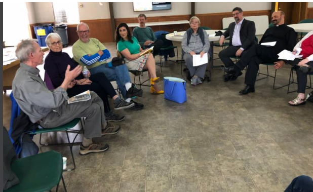
Salt Lake County Council Member Shireen Ghorbani discussing housing policy at CORC's meeting on April 2, 2019.

week and both were both very productive.