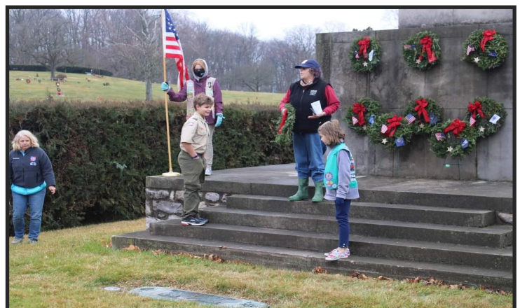
The Scout troops placing the wreaths at the graves.