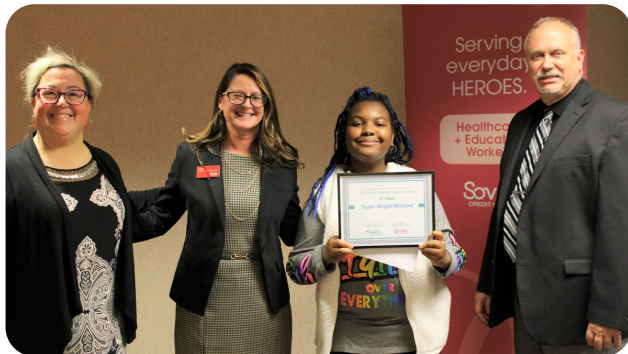
2022 Essay Winner