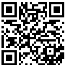
Grace's Gala Web Page

Tickets now available for purchase on the Grace's Gala page of our website!