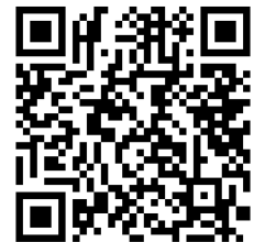
EDOW's Tending Our Soil

You may have noticed we commissioned our Tending Our Soil Team Leaders last Sunday! We are so excited to be a part of the Tending Our Soil initiative from the Episcopal Diocese of Washington. To learn more about this project and what it means for our community here at Grace, please scan the QR code.