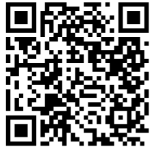
28th Bach Festival

Thank you for your patience as we have been getting this concert rescheduled. We are so excited to have Con Brio back on the 24th! Scan the QR code to learn more about the concert and to purchase tickets! Email bach@gracedc.org or office@gracedc.org with any questions. Hope to see you there!