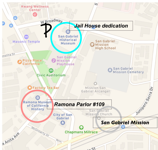
Parking at San Gabriel Mission Playhouse