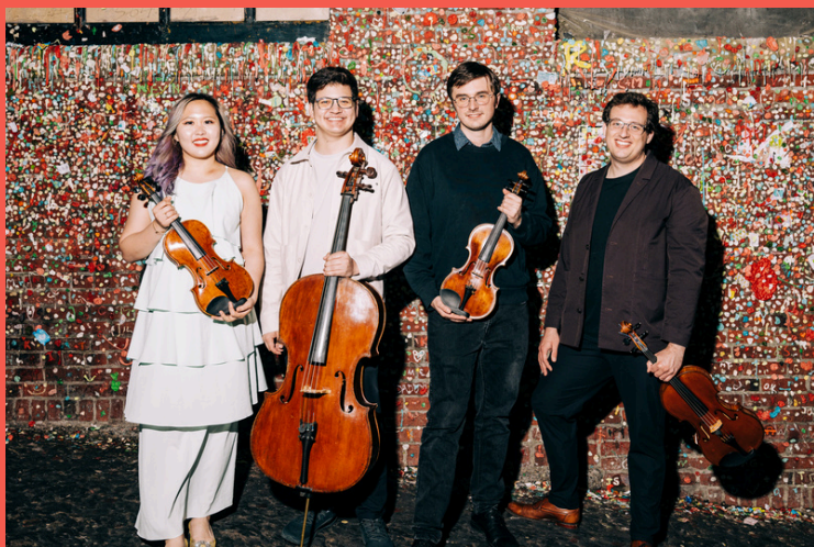
The Balourdet Quartet

An Experiential Concert and Conversation with the Seattle Chamber Music Society String Quartet-in-Residence