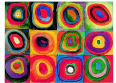
Artist: Wassily Kandinsky Activity: Painted Garden Flag

Do you enjoy art, learning about artists, creating projects of your own? If you said yes to any or all of those questions, join us for our new monthly program, Inspired by Art . Each month we will take an in-depth look at an artist, their work, and their process. We will then make a small art project using one or more of their artworks as inspiration. Freedom of expression will be encouraged. The March workshop is $10 per person and includes the blank flag, metal yard stake, and all paint and materials to complete the project. Space is limited. Please register before March 21 st .