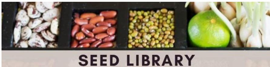
The Seed Library is a partnership between the Colchester Garden Club and the Cragin Memorial Library.

Annuals & Perennials Vegetable Gardening Lawns Trees and Shrubs Wildlife Yard Accessories Resources