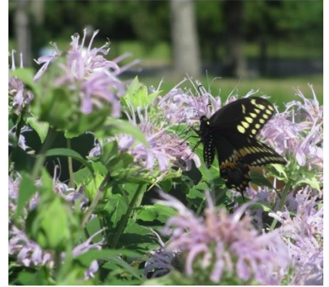
Black Swallowtail on native Bee Balm ( Monarda fistulosa ) or Bergamot at Cohen Woodlands.