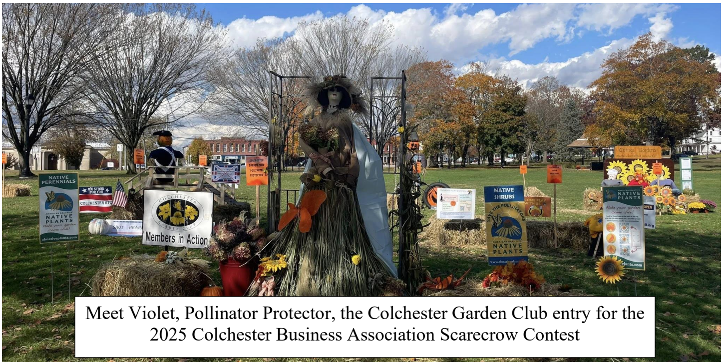
Meet Violet, Pollinator Protector, the Colchester Garden Club entry for the 2025 Colchester Business Association Scarecrow Contest

To request information about the Colchester Garden Club, membership materials, or gift membership, please email colchestergardenclub@yahoo.com