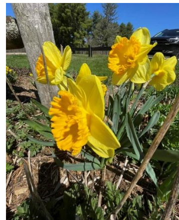
(Daffodils planted by CGC at Cohen Woodlands)