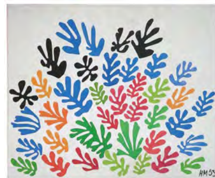
Artist: Henri Matisse Activity: Faux Stained-Glass Vase, Dish, or Window Hanging

Join us for our new monthly art program. Each month we will take an in-depth look at an artist, their work, and their process. We will then make a small art project using one or more of their artworks as inspiration. The workshop is $6 per person and includes everything you need to complete the project. Space is limited. Please register before April 18 th .