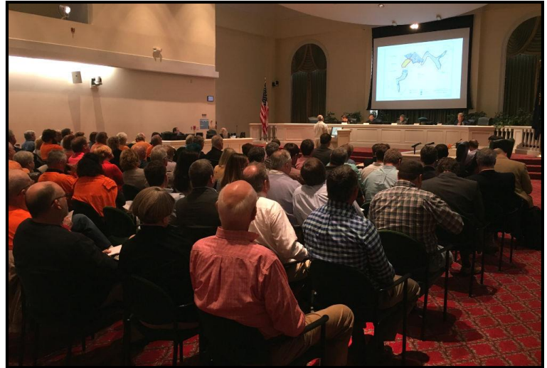
Wilmington's Subdivision Review Board Meeting Packed: Normally a relatively low-key event, the room was filled on January 18, 2017.