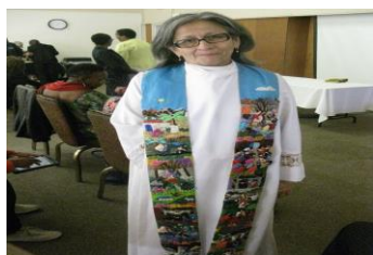
Mo. Yamily at 2017 Stony Point

We know that many of our sisters in the Episcopal Church Women in the United States are the forces behind