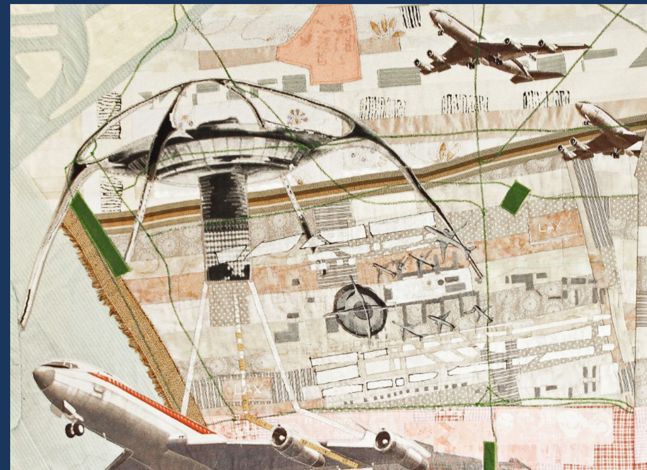
LAX 01 - Ellen November