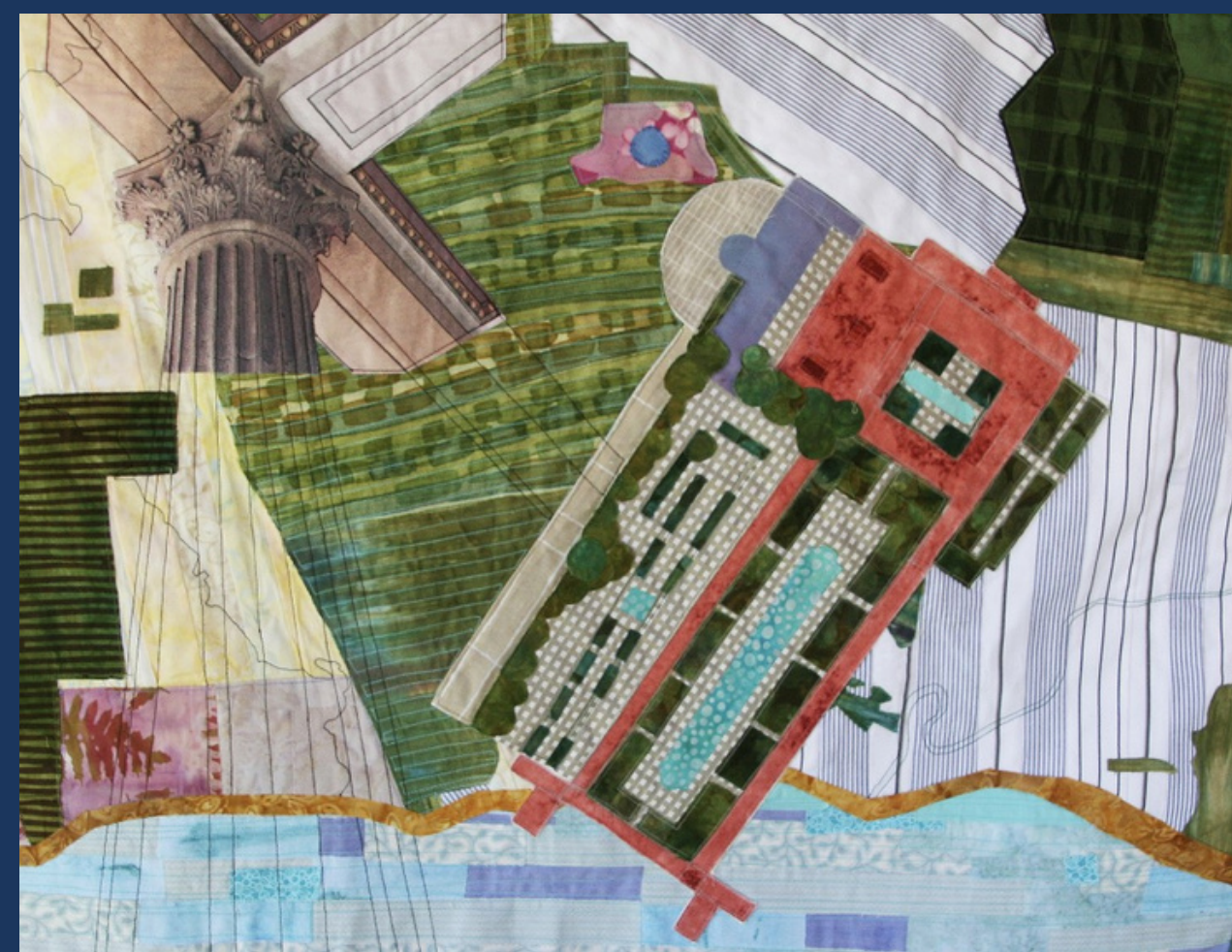
Getty Villa - Ellen November