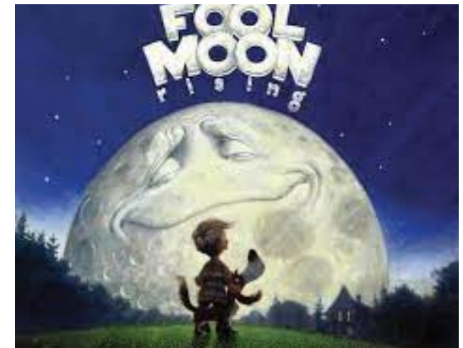
Illustration: We read through "Fool Moon Rising" together to explain how sin is thinking that we are the center of the universe. It is like being proud of how great we are without realizing that all we have is the gift of a good God that we are failing to honor. The book concludes by showing that a greater joy is found in worshiping this good God who made us to know him.

These passages remind us that we are naturally sinners and that our sin leads to death.