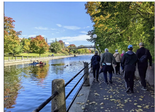
Just so lovely!