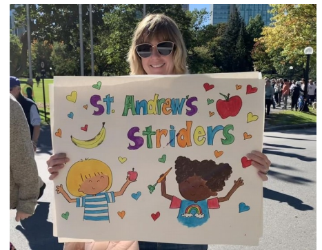
Best decorated poster