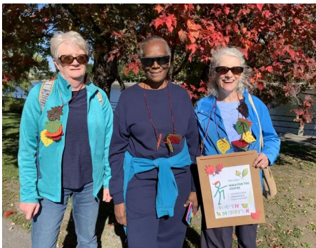
Spirit of the Walk