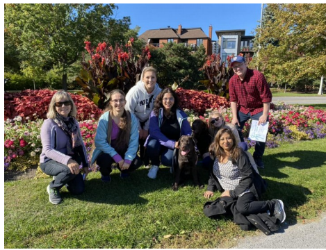
Loveliest scene from the Walkathon