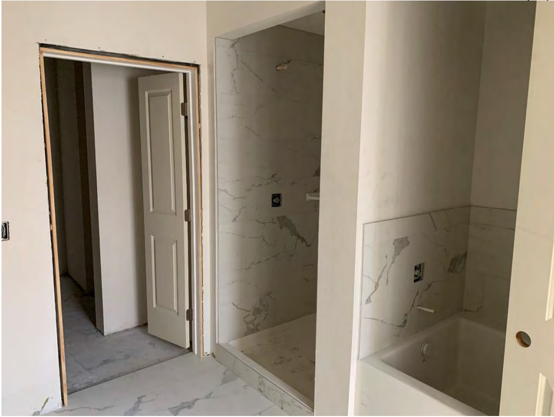
Unit Mockup Progress