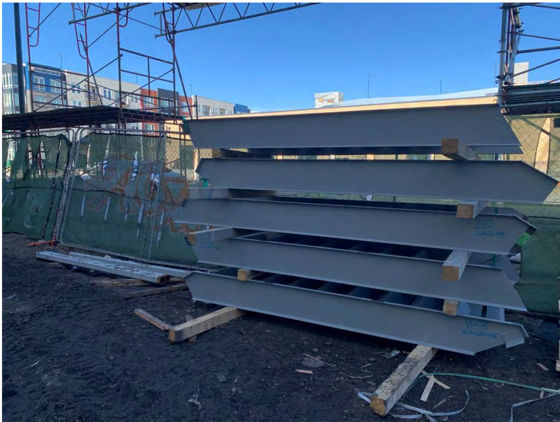
Stair 3 Steel Delivery