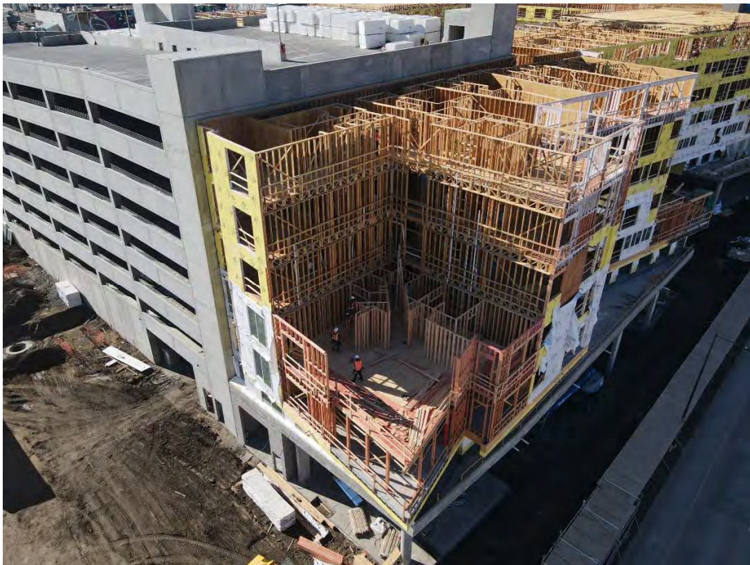
Corner Unit Framing Progress