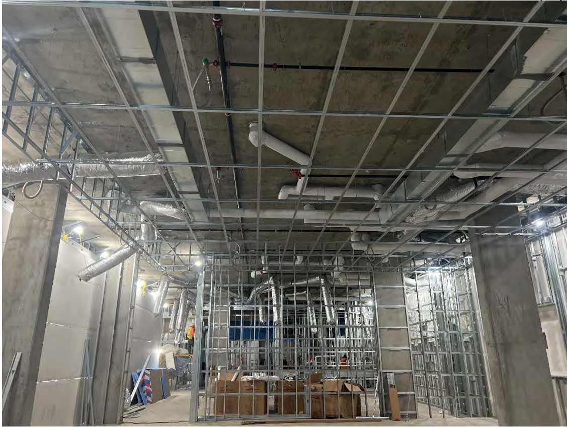
Amenity MEPF Rough-In