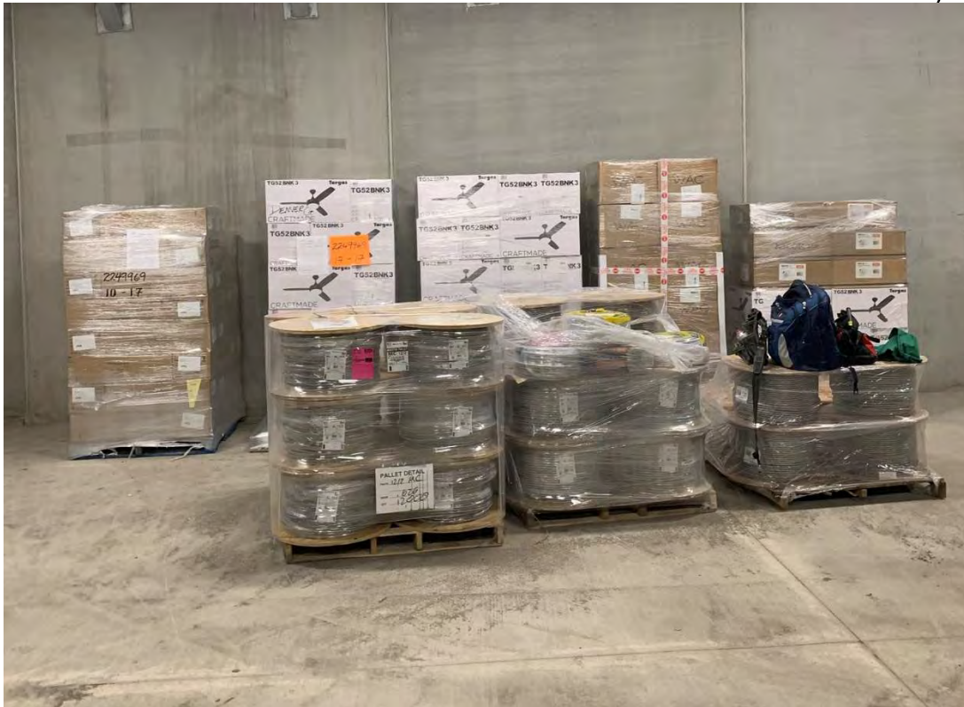
Production Units Fixture Delivery