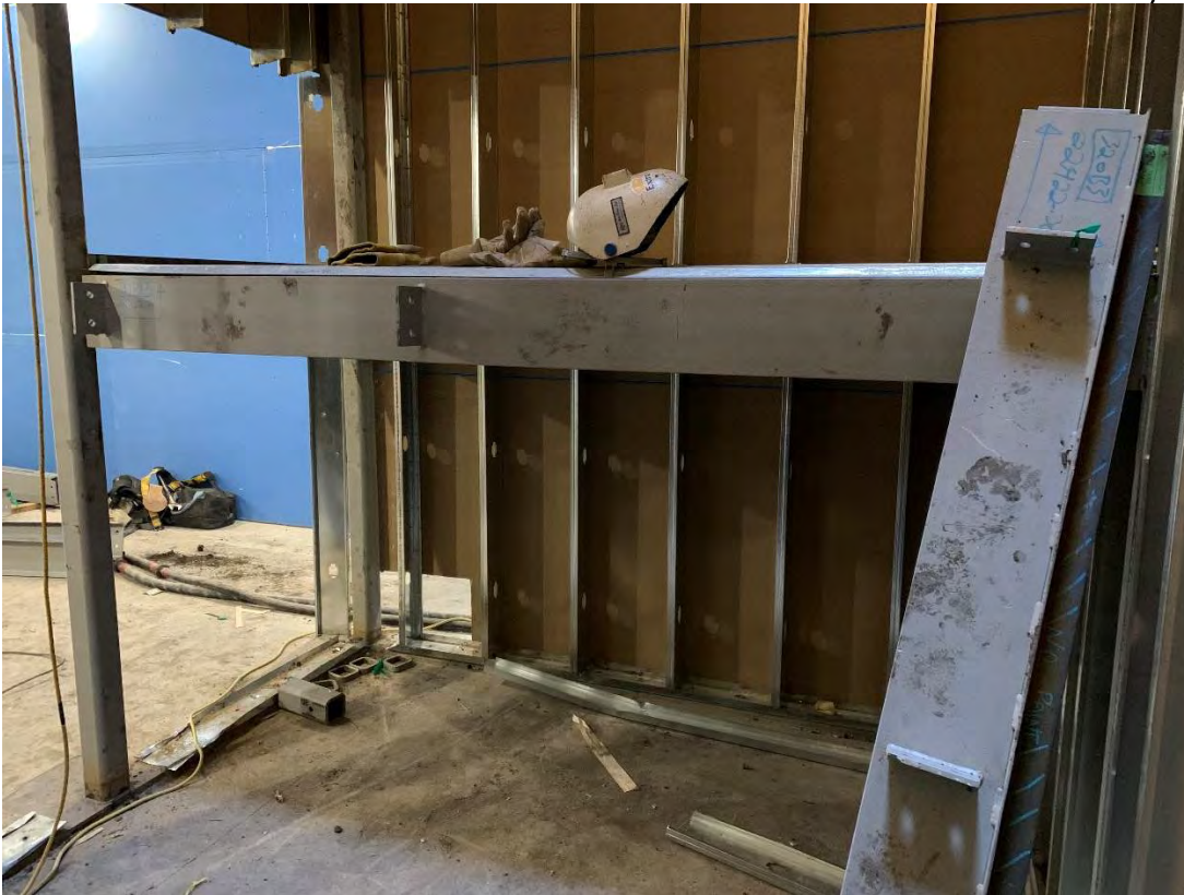
Stair 3 Install