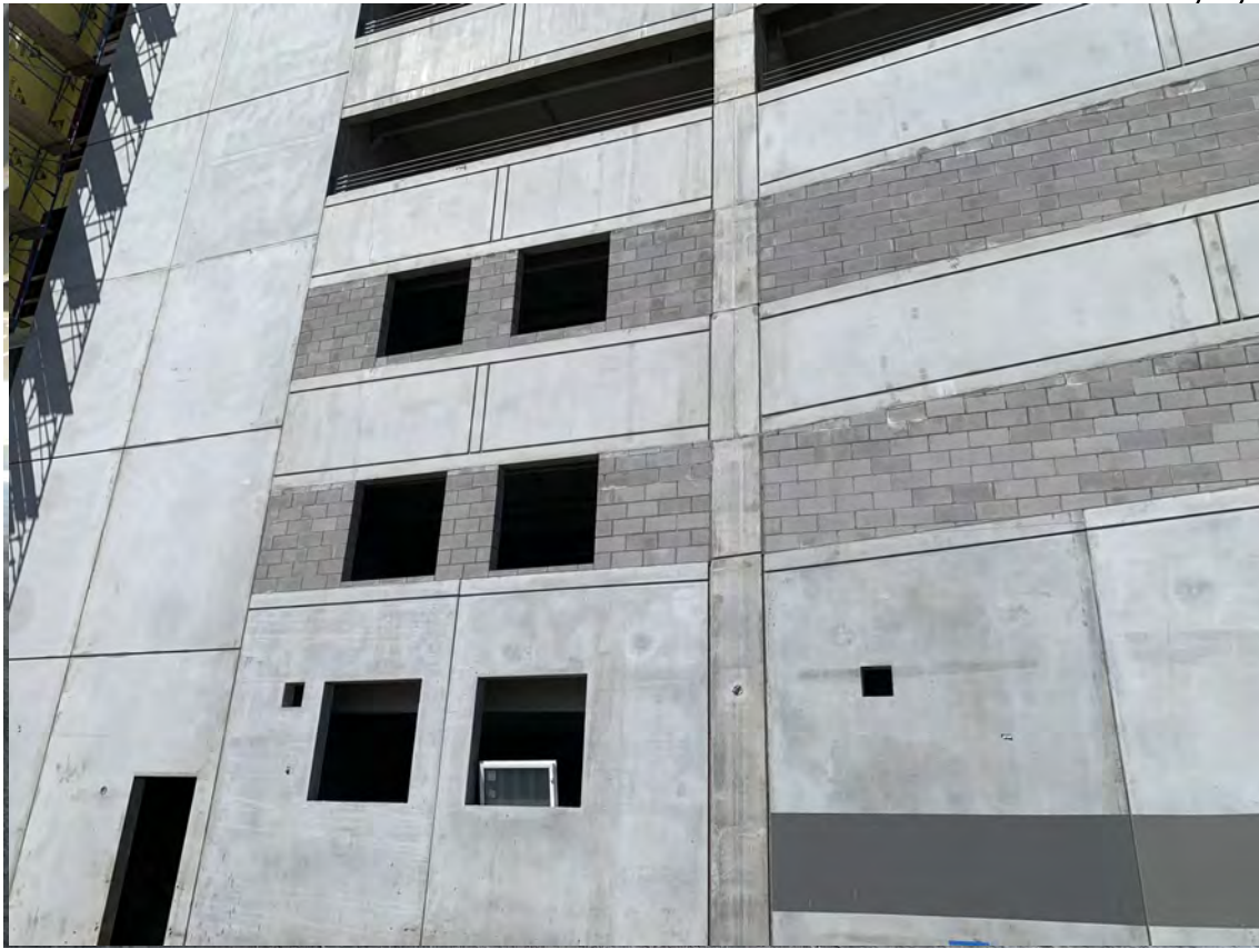
Garage CMU Infill Completed