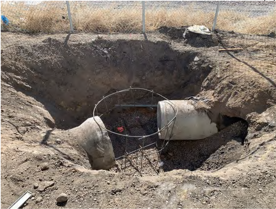
CIP Storm Water Structures