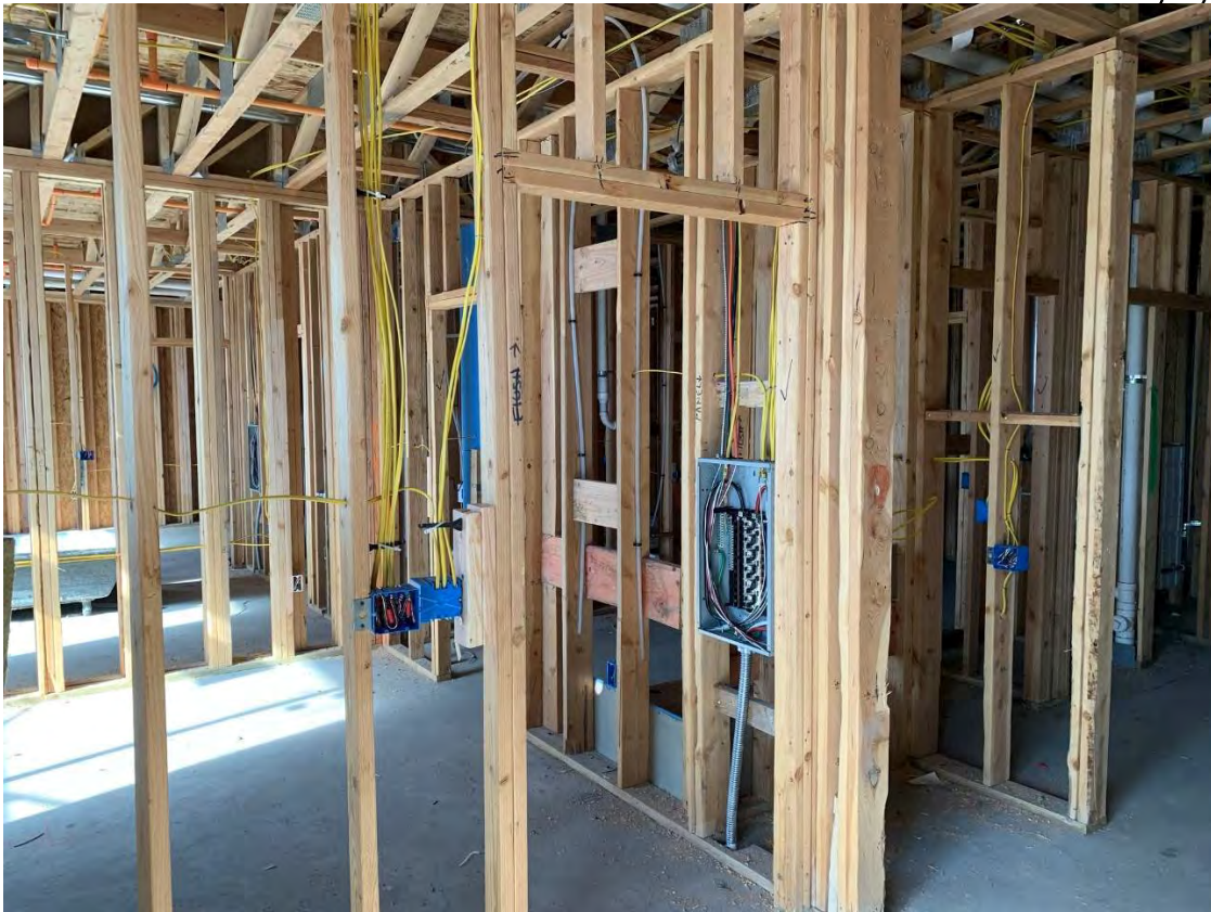
Wood Framing MEPF Rough-In