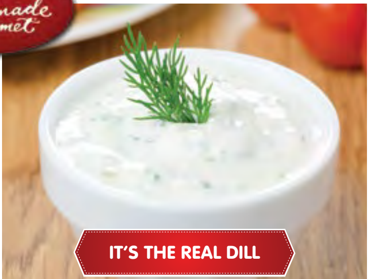
IT'S THE REAL DILL