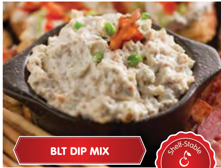
BLT DIP MIX