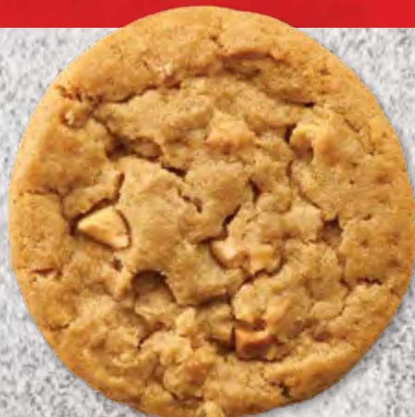
7265 Peanut Butter

Silky pieces of rich dark chocolate, milk chocolate and white chocolate come together to create a dreamy trifecta of chocolaty decadence.