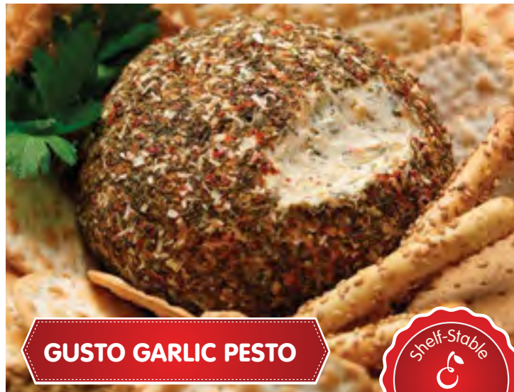
GUSTO GARLIC PESTO