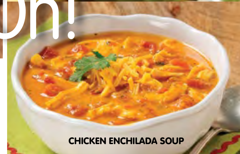
CHICKEN ENCHILADA SOUP

1610 Fiesta Soup Trio Mezclas de sopa, 3 sabores Our Fiesta Soups, all in one box! A great gift for the soup/Mexican food/chicken enchiladas lover. Simmer in minutes for restaurant-quality flavor at home. Includes one single recipe size packet of each: Chicken Enchilada Soup Mix, Tortilla Soup Mix and Taco Soup Mix. Each packet serves 6.