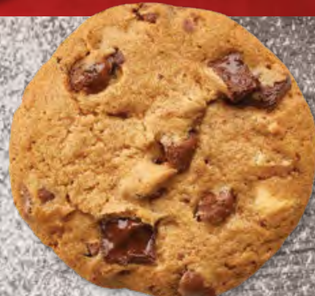
7266 Triple Chocolate Chunk

White confectionery chips, sweet dried strawberries and tart dried cranberries combine for such a blast of delectable flavor, you'll savor every bite.