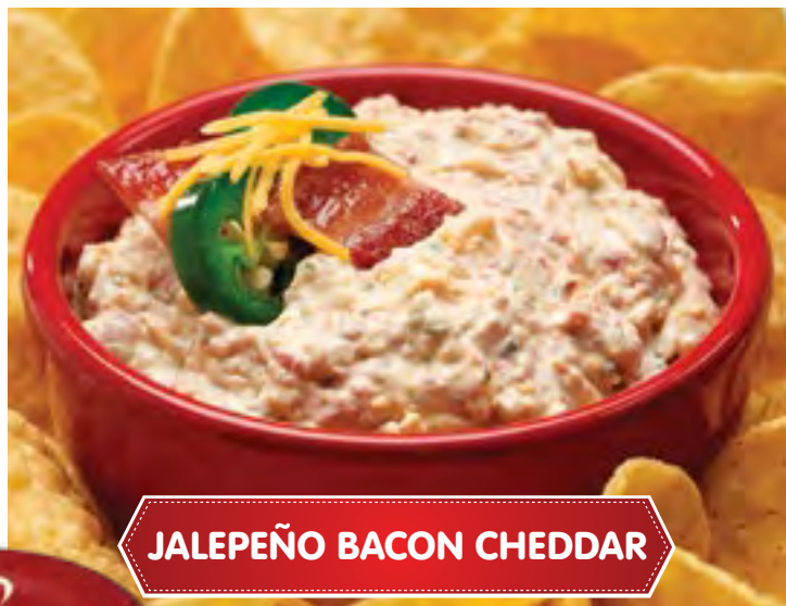
JALEPEÑO BACON CHEDDAR