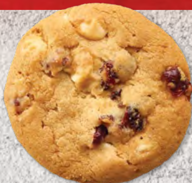
7273 Strawberry Shortcake

Approx. 36 1.1 oz. pre-formed cookies in a 2.5 lb. carton.