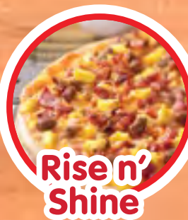
Rise n' Shine