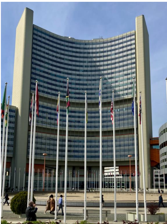
At IAEA in Vienna

It started with a visit to the IAEA's Procurement-Department at the United Nations in Vienna, where we presented Tracer-QC for the first time as an easy-to-use and comprehensive solution for beginners in the production of PET radiopharmaceuticals. Especially in developing countries, where the focus is on the provision of ^{18}\text{F} -FDG, an all-in-one solution can be a quick entry into the GMP-compliant production of ^{18}\text{F} -FDG.