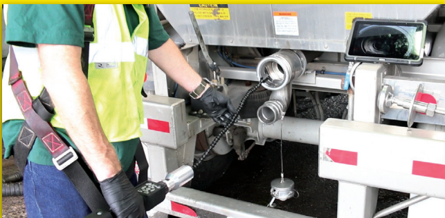
Optional Valve Inspection Camera shown with 10" rugged display