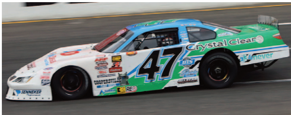
Jim DenHamer file

Lap leaders: Campbell 1-46, Stovall 47-75 • Cautions: 3 • Fast qualifier: Hull, 16.571 seconds