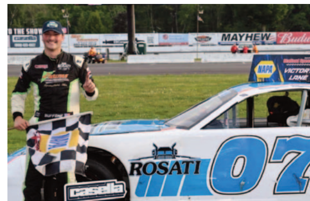
TK Race Photos

Lap leader: Buffone 1-30 • Cautions: 2 • Fast practitioner: A.Fearn, 21.599 seconds