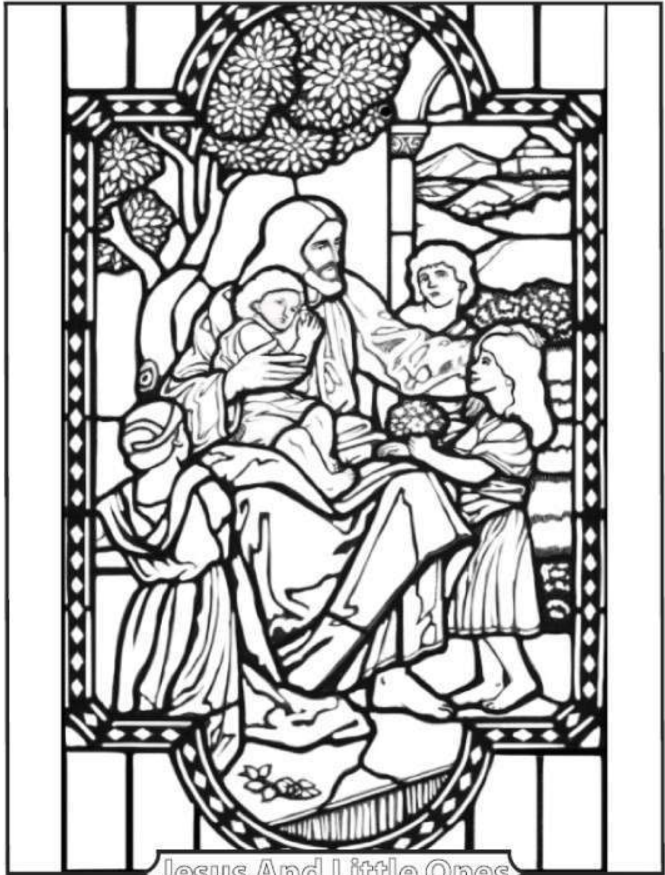
Jesus And Little Ones