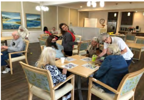
The Pilot Club of Tallahassee presents BrainO every month to six Assisted Living/Memory Care facilities in Tallahassee.