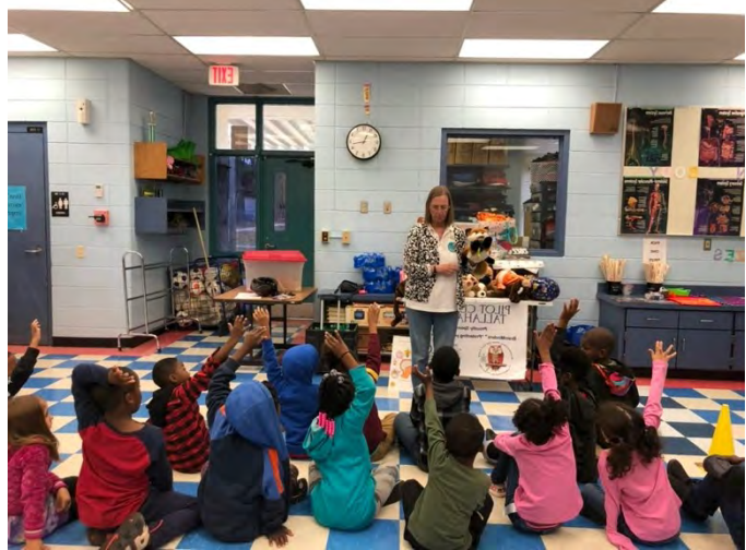
BrainMinders at Gilchrist Elementary School, presented to 415 kindergarten-second grade students.