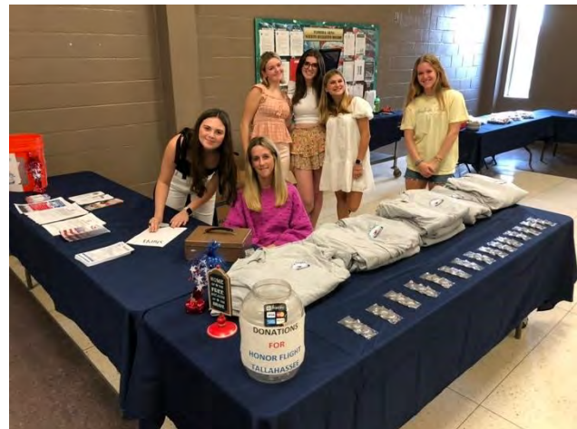
. Leon High School Anchors, volunteered their time, to help at the Honor Flight Reunion dinner. They helped by working at the desserts and beverage stations, selling t-shirt and commemorative coins and being available for whatever was needed to be done.