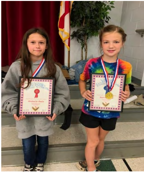
Two of the top essayist from Canopy Oaks Elementary School, who took part in one of the Pilot