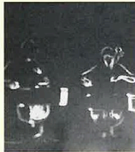
July 21, 2024, 5:00 p.m. Pittsburgh Cello Quartet