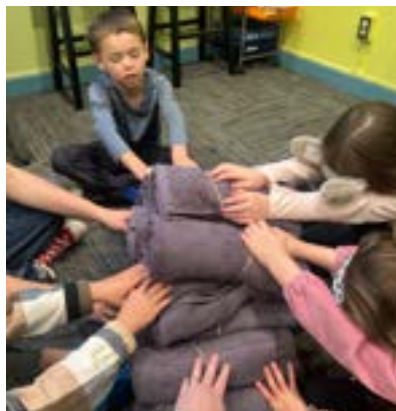
Left: Our Children Making Lutheran World Relief Heath Kits Right: Our Quilters beautiful handiwork.