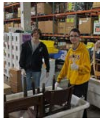
Our Middle School Youth Helping at POM's Thanksgiving Food Bank (below)