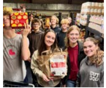
High schoolers: (above) Helping get POM Food Bank ready for Thanksgiving (below) Sorting donations at Union Gospel Mission Warehouse