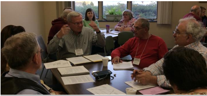
“Discerning the Body: What We Need to Know About Our Churches to Lead Them Effectively through Change” Fall 2016 Learning Event

Our fall and spring gatherings bring a diverse group of people together for thought provoking programs and vital community. We come together at a retreat center, gathering for dinner on Friday night and closing with a Saturday afternoon communion service.