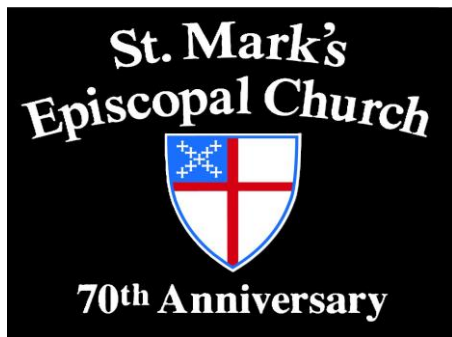
Design on Black Garment