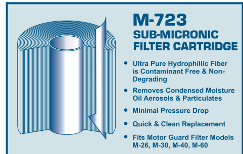
Hydro-Pure™ Media Technology

Hydro-Pure™ cartridges are designed to capture particles as small as .01 microns in size as well as absorbing many times their weight in moisture and trapping the smallest traces of oil.