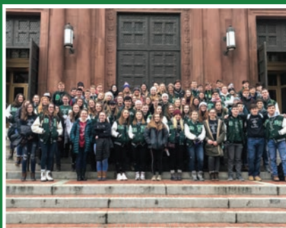
Front Page photo: DEFENDING LIFE Students from Lancaster Fisher Catholic High School's Irish4Life group pose for a picture at the 2019 March for Life in Washington, D.C. The school will send more than half of its student body again this year to the March.