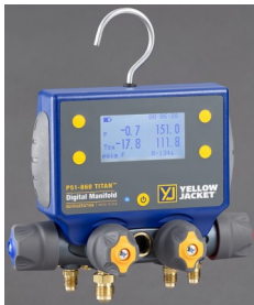
P51-860 TITAN™ Digital Manifold