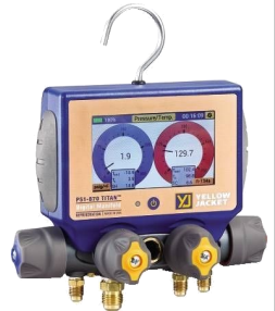
P51-870 TITAN™ Digital Manifold