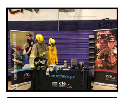
The Fire Science Pre-Apprenticeship booth at Bret Harte High