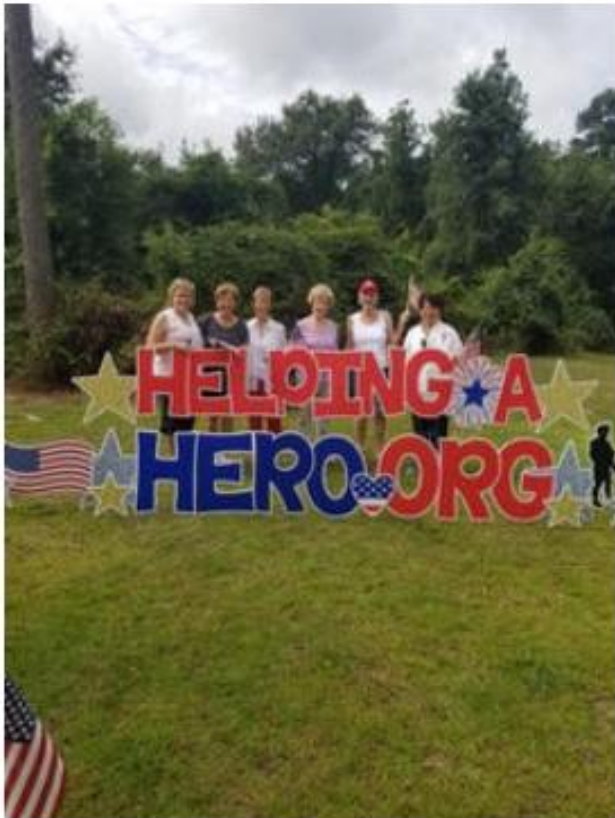
HOMES FOR HEROES GROUNDBREAKING