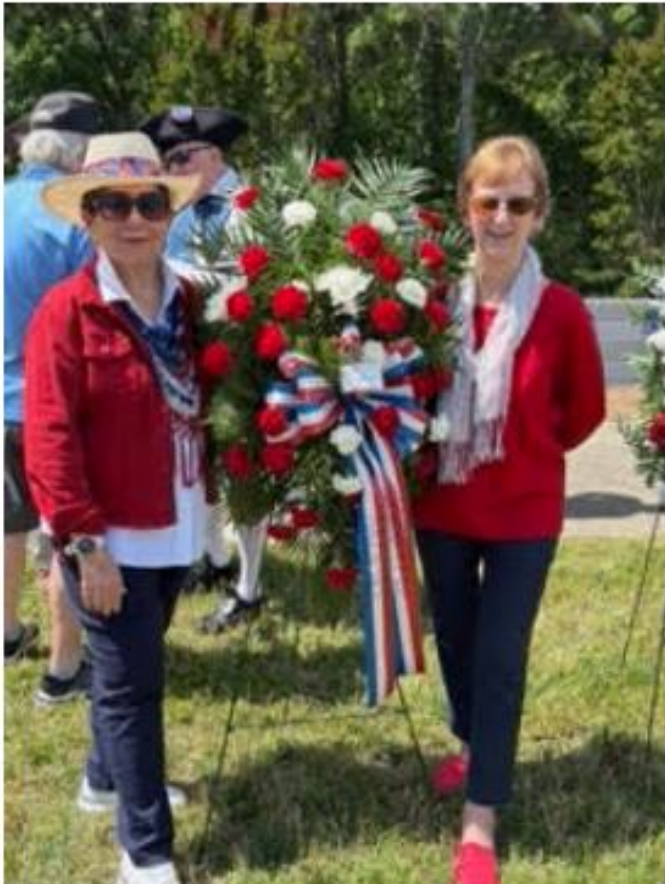
MEMORIAL DAY WREATH LAYING AT VIETNAM VETERANS MEMORIAL