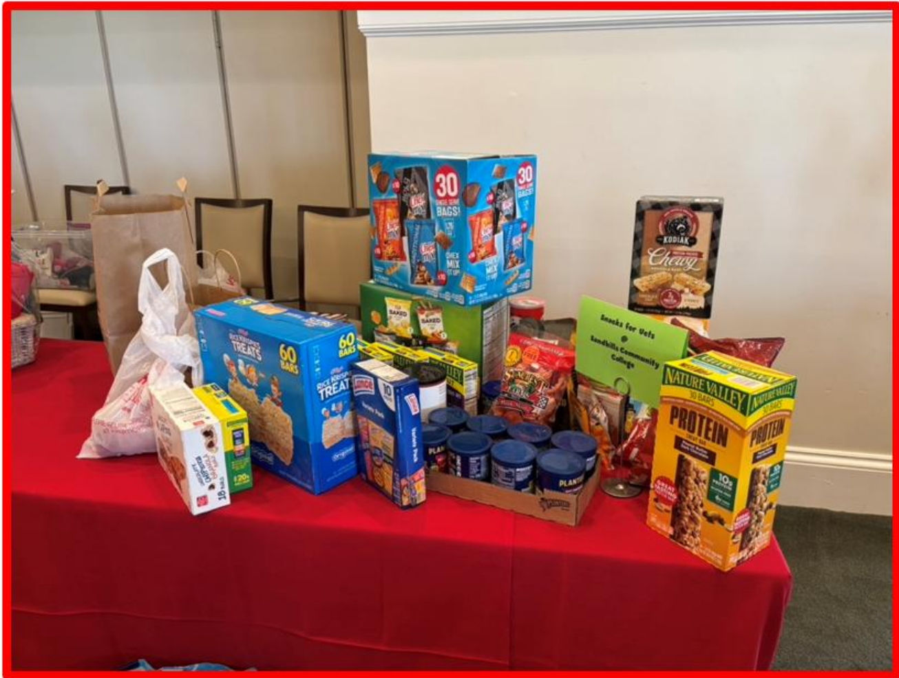
DONATIONS FROM MOORE REPUBLICAN WOMEN TO THE VETERANS' LOUNGE