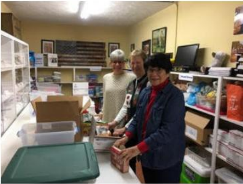
MEMBERS ASSEMBLING THE BOXES