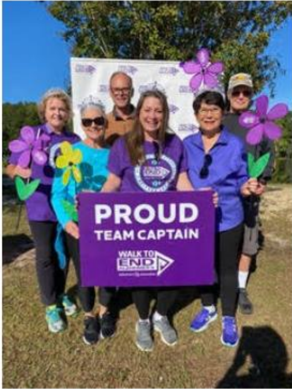
WALK TO END ALZHEIMER'S