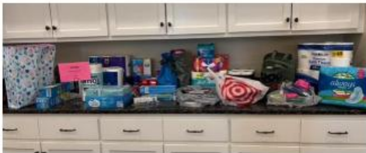
BACKPACKS FOR HOMELESS VETERANS

These are some of the personal care items that our members donated to Military Missions in Action to help fill backpacks of homeless vets.