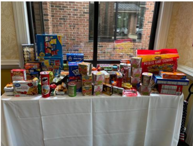
ITEMS DONATED FOR THE "FILL THE FOOTLOCKER" PROJECT