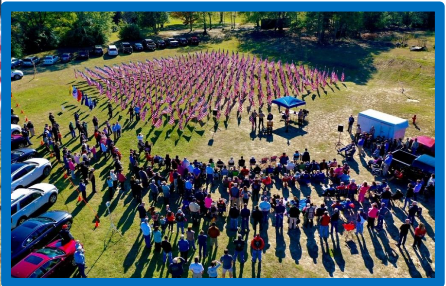
VIETNAM VETERAN AT THE FIELD OF HONOR