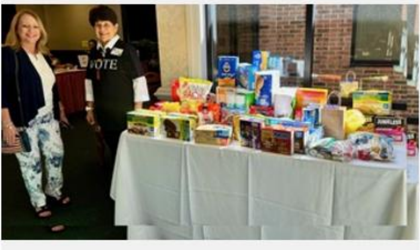
ITEMS DONATED BY MRW MEMBERS