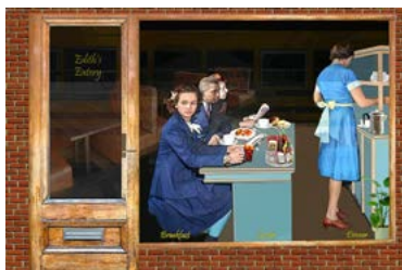
Exhibit on display: Friday, May 1–Monday, May 25 UUCSR Art Gallery All are welcome!

Artist Reception: Sunday, May 17 1:00–3:00 PM