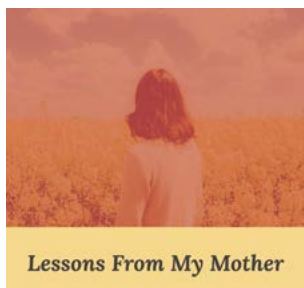
Lessons From My Mother

Lessons from my Mother The lessons and insights from our mothers are often some of those closest to our hearts, and because they are planted so deeply within us, they can even thrive and take on a life of their own. Good mothers can never really leave us, because their gifts to us can flourish within our lives even after they have gone.