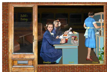
Exhibit on display: Friday, May 1-Monday, May 25 UUCSR Art Gallery All are welcome!

Artist Reception: Sunday, May 17 1:00-3:00 PM