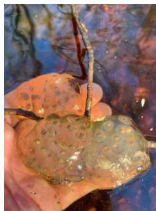
spotted salamander eggs