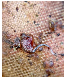
fairy shrimp, magnified 10x