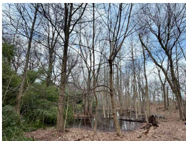
UUCSR southern vernal pool