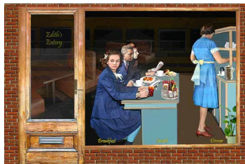
Exhibit on display: Thursday, April 23–Tuesday, May 26 UUCSR Art Gallery All are welcome!

Artist Reception: Sunday, April 26 1:00–3:00 PM