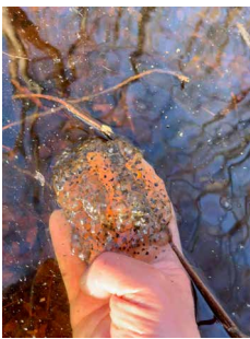
wood frog eggs